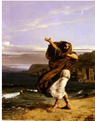
Demosthenes Practising Oratory (1870)

DUE: Your Informal Proposal is Due Saturday