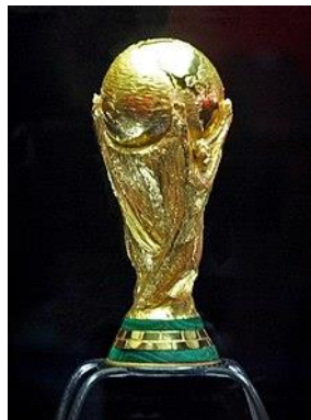
FIFA World Cup Trophy

Next Sunday is the Super Bowl LVIII at Allegiant Stadium in Las Vegas, Nevada , so this is Super Bowl Week . People around the world, and especially in Europe, often have a difficult time understanding the hype for one game. They're used to the FIFA World Cup matches , which is like having SIXTEEN Super Bowls in a month—no, it's even worse than that. . . .)